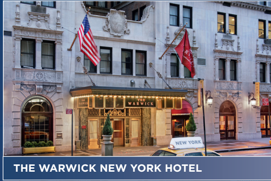
THE WARWICK NEW YORK HOTEL